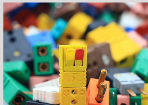
Our Thermo Sensor connectors

This intuitive assembly method ensures significant time and cost savings in your daily workflow. In addition, our Quick Wiring miniature connectors offer maximum flexibility: they are fully compatible with all standard miniature connectors on the market as well as common miniature measurement modules. This allows you to integrate state-of-the-art technology seamlessly into your existing systems.